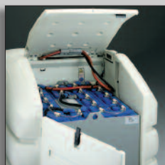
Large battery compartment