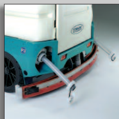
Convenient drain hoses