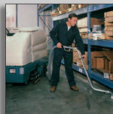
Optional power wand